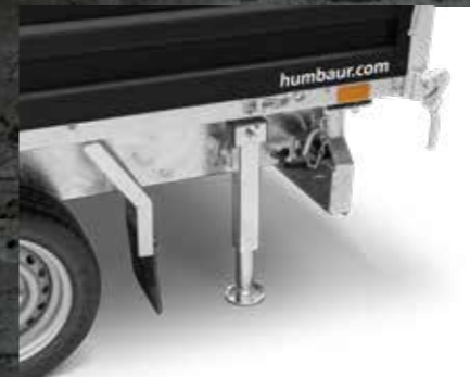
TELESCOPIC CRANK SUPPORTS Optimum stability, foldable