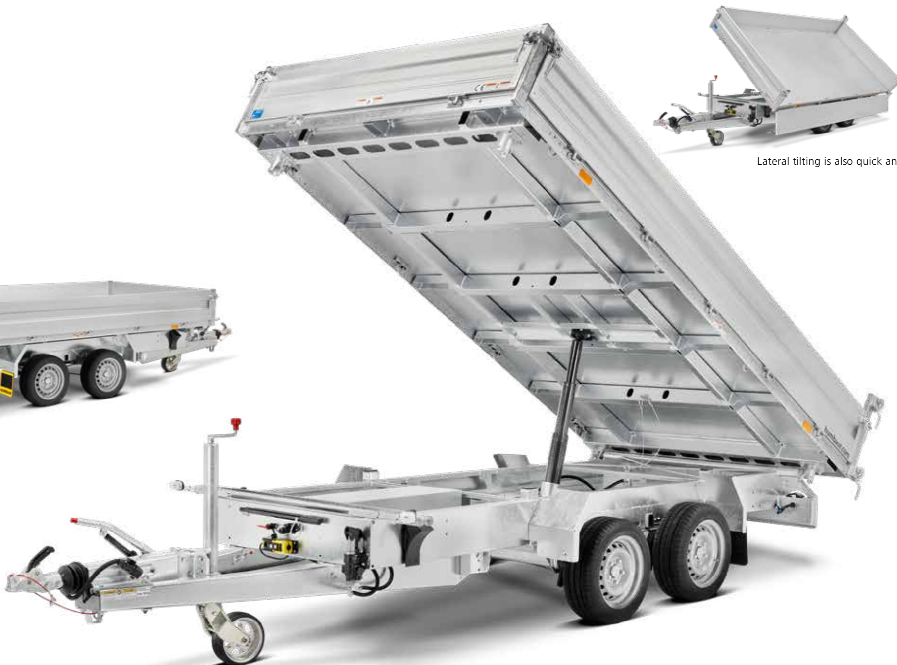
Lateral tilting is also quick and easy.