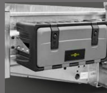
Ingenious functionality and useful accessories