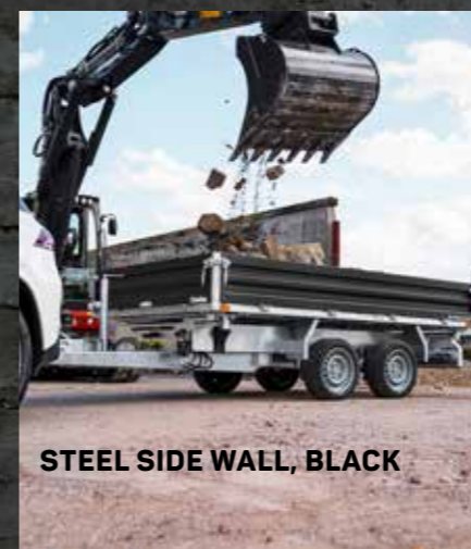
STEEL SIDE WALL, BLACK