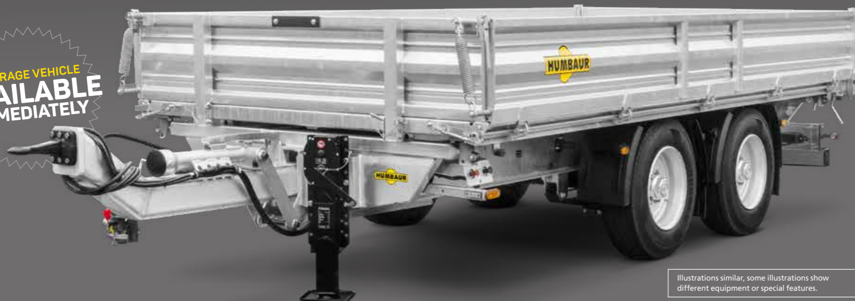
Illustrations similar, some illustrations show different equipment or special features.