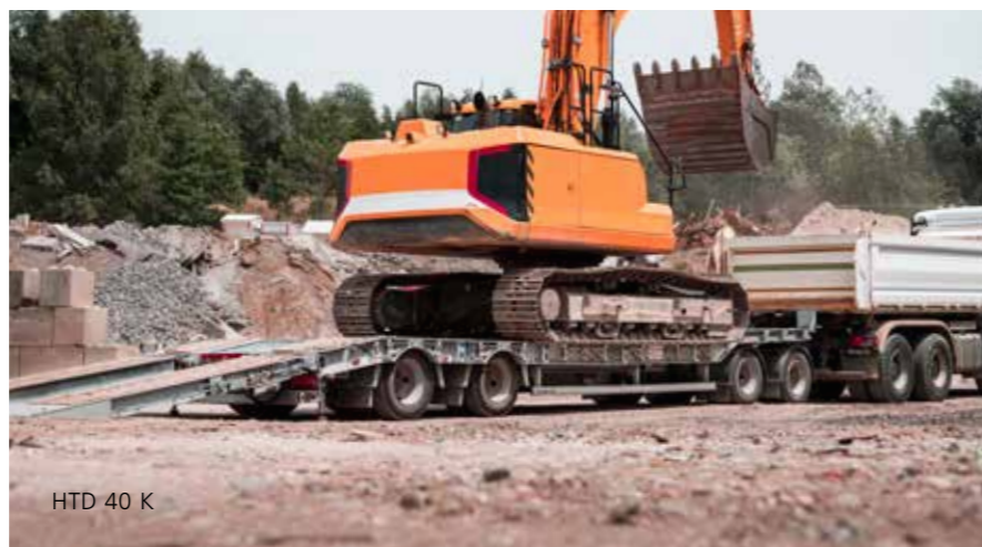
HTD 40 K

If your trailer has a gross weight of up to 3.5 t, your dealer near you will be happy to help. Owners of trailers with a gross weight of 5 t or above can use our direct service. Whether you need a spare part or have a question about how to use your trailer – we and your local dealer, will be happy to help. Additional benefits and services are available for a variety of heavy duty products!