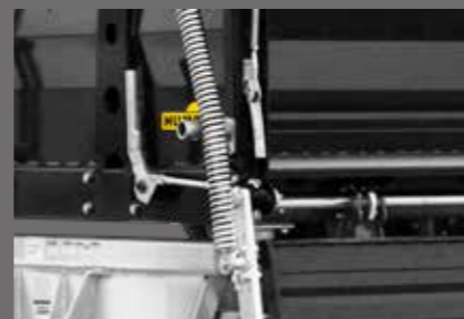
Ingenious functionality down to the last detail