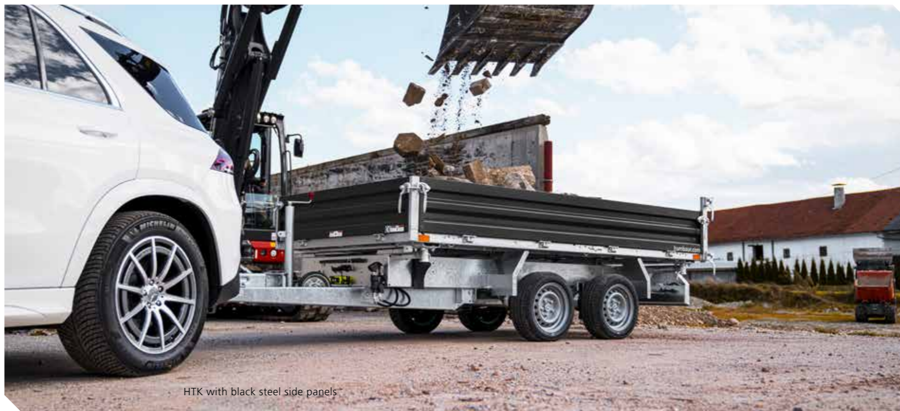
HTK with black steel side panels