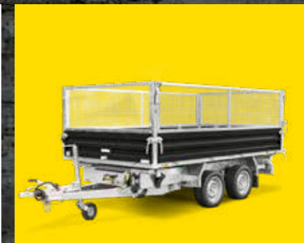
STEEL LATTICE EXTENSION Perfect for gardening and landscaping