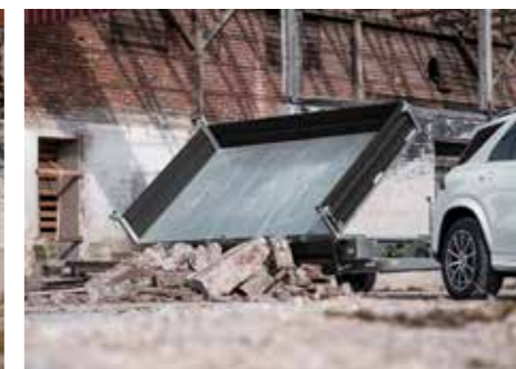
The HTK can be tilted backwards and sideways in a few simple steps.