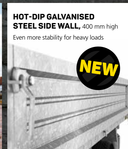
HOT-DIP GALVANISED STEEL SIDE WALL, 400 mm high Even more stability for heavy loads