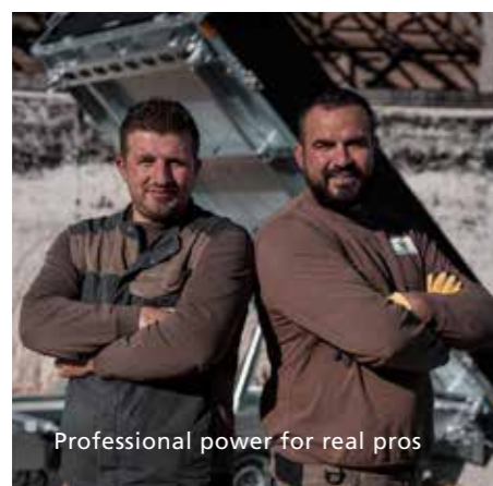
Professional power for real pros