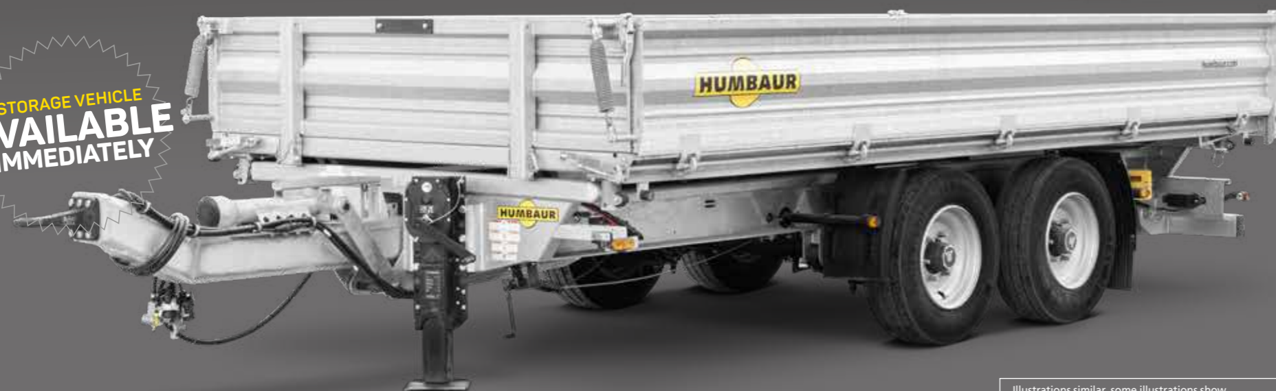
Illustrations similar, some illustrations show different equipment or special features.