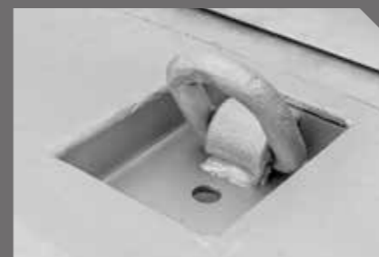
Ingenious functionality down to the last detail