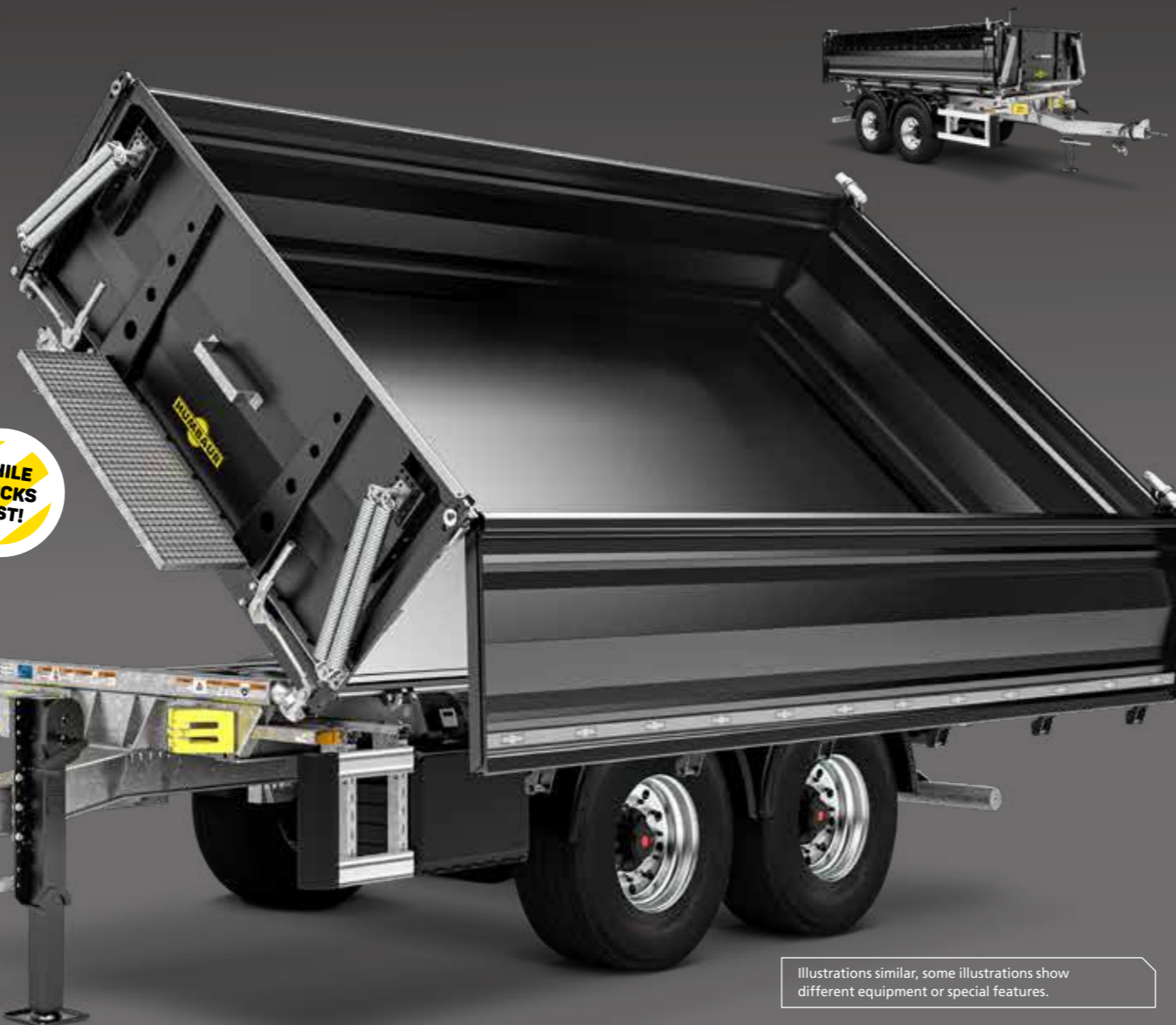
Illustrations similar, some illustrations show different equipment or special features.

With a permitted total weight of 19 metric tons, the HTK 19 is not only meant for bulk goods such as dirt, sand, gravel and concrete, but also for building materials such as paving stones and concrete blocks. Constructed to accommodate pallet widths, the tandem three-way tipper also allows for the secure transport of palletized goods. Its optimal driving and tilting characteristics make it an indispensable companion, especially in heavy-duty applications — and all at a relatively low tare weight. The tipping bridge is provided with cathodic dip-paint coating and lacquer as standard.