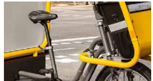
Optimised seating position for the rider for maximum pedal power