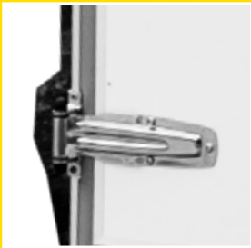
Stainless steel hinges ensures that the rear door remains stable for longer.

With a volume of up to 1.4 m 3 and space for a Euro palette , the container provides everything you need for transporting goods.