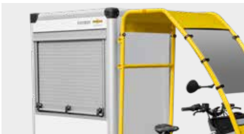
Large right-hand roller shutter for quick loading and unloading (optional)

World-renowned chassis construction based on the CRUISER velotaxi